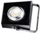
Bright single stage Light ( blinder )